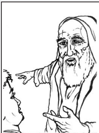
Lamech told stories about Adam to Noah.

Read the family history in Matthew 1:1–17. What do these verses teach us about the people in this list? How do we know that they were real people? How is that important for our faith?