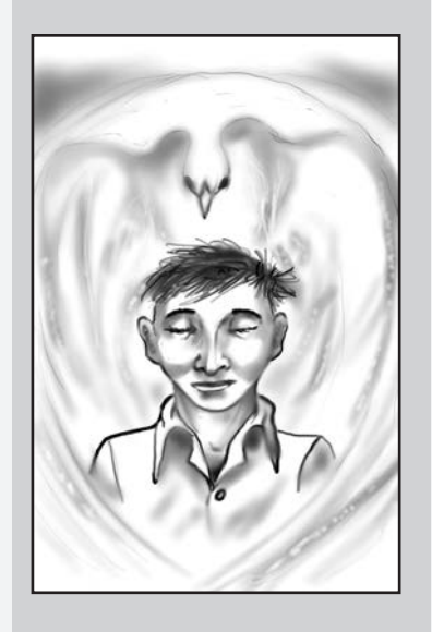
"When you get the fire of the Holy Spirit, you won't be afraid of the fire at the end of earth's history."