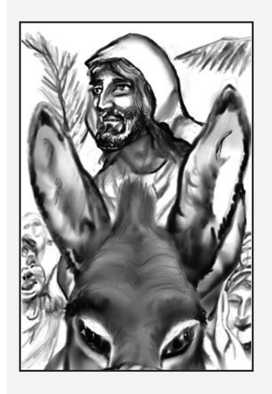
"Now Jesus comes to Jerusalem as the promised King."

The time for keeping secrets was over. Now Jesus enters Jerusalem in a way that shows everyone that He is their King. Jesus enters the temple and leaves because the time is late. Then Jesus and His Twelve Followers go to Bethany. The exciting day ends with Jesus' leaving the city. But tomorrow will be different.