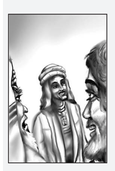
The lawyer tells Jesus that the most important commandment is to love God with all your heart, spirit, mind, and strength.

How do we learn to love God and love our neighbors the same as we love ourselves? How does the Cross help us to love God and our neighbors?