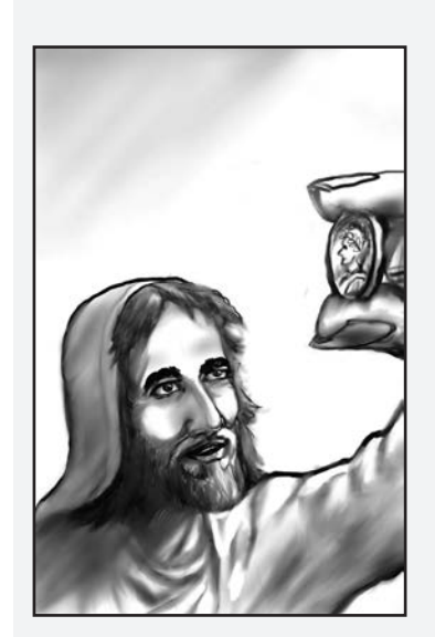
Jesus' answer is to give to the king of Rome the things that belong to him and to give to God the things that belong to God.

WHAT WE OWE TO GOD AND MAN (Mark 12:13–27)