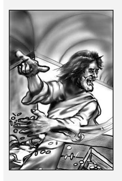
Jesus chases away the sellers from the courts so that people may worship in quiet.

What things in your life do you need Jesus to clean? How does this cleaning happen?