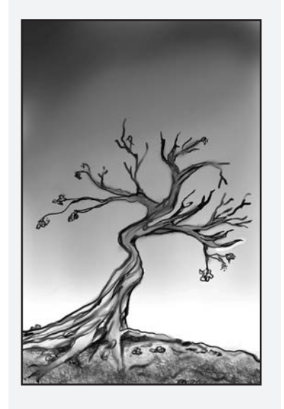
"The selfish ones who live for self are the same as the fig tree that had no fruit."

"Jesus announced that the tree will die. Jesus' own power made that tree. This announcement is a warning to all churches and Christians. No one can live the law of God without serving other people. But many people are selfish. They do not show mercy. Some people think they are excellent Christians. But they don't understand what it means to serve God. They plan and study to please self. They act only to make self happy. They use their time to get what they can only for self. Everything they do in life is for self. They don't help anyone else. God made them to help and bless other people in every possible way. But self is so big they can't see anything else. They don't care about other people at all. The selfish ones who live for self are the same as the fig tree that had no fruit. They are false Christians. They go to church. But they don't confess their sins or have real faith in God. They don't obey Him. They say they are Christians, but they don't serve Him. When Jesus judged the fig tree, He showed that He hated fake Christians. Jesus announces that the worst sinner is less guilty than the Christian who says he serves God but who does not obey Him or honor Him."-Ellen G. White, The Desire of Ages, page 584, adapted.