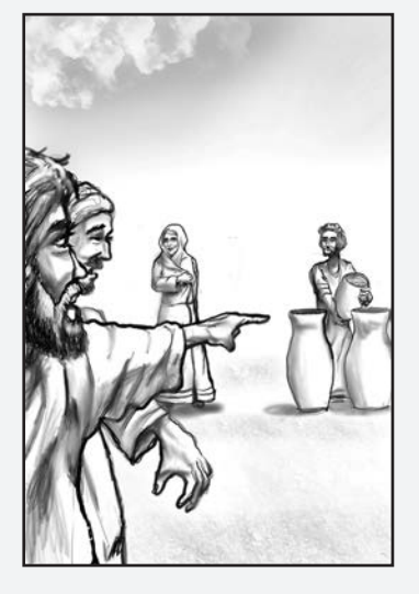
Jesus changed water into wine.

What did the master of the feast think about the water that Jesus changed into grape juice? The master of the feast was surprised. The juice tasted wonderful. The master of the feast didn't know that Jesus did a miracle. The master thought that the people in charge of the wedding saved the best juice for the end.