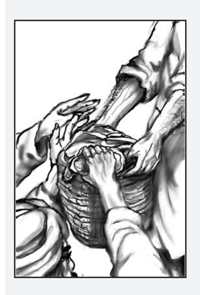
All these things help the Jews understand that Jesus is the new Moses.

John shows Jesus doing miracles that have special meaning for the Jews. Jesus' miracles show His people who He is. His miracles show the people that He is God.