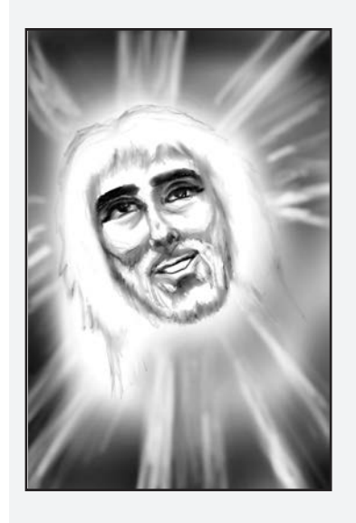
John tells us that Jesus is "the Light of the world [all people]" (John 9:5, NLV).

What important rule do we read about in 1 Corinthians 1:26–29? How can this rule help us today?