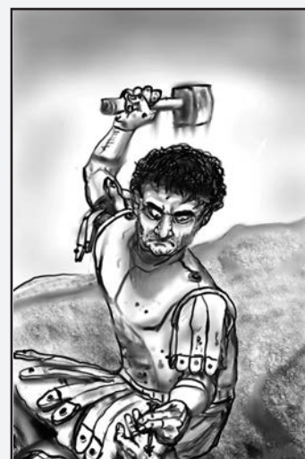
The people He came to save nailed Him to a cross.

Jesus' life was often hard. In the end, the Jewish leaders rejected Him. Judas, Jesus' follower, sold Him for money. The people He came to save nailed Him to a cross.