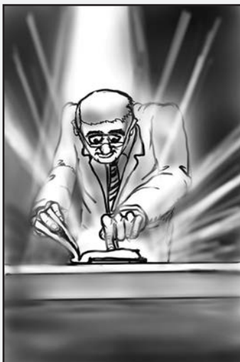
The Bible helps us understand the Bible.

How does our obedience to God show our love for Him?