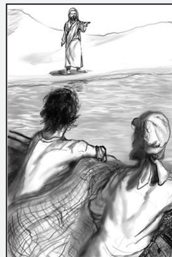
The Stranger tells the followers to throw their nets off the right side of the boat.

But this idea is not correct. Peter answers the way he does because his heart is empty of all pride. We also see that Jesus accepts Peter’s answer because the Lord gives him back his work to do for God. When we work for God, our hearts must be empty of all pride. Then we will look to Jesus and not to ourselves for strength, wisdom, and help to do His work.