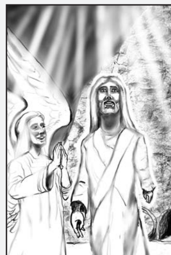
Jesus is the Resurrection or waking up from the dead, and the Life.

As we saw already, our Three-in-One God is named the Godhead. The Godhead includes the Father, the Son, and the Holy Spirit. The Godhead and Their Word, the Bible, will lead us to Them. "God talks to us in His Word. We will hear many voices talking to us. But Jesus warned us to be careful of the ones who say, Here is the Savior. Or there is the Savior. How will we know if someone teaches Bible truth? We must compare everything they say with the Bible."—Ellen G. White, The Advent Review and Sabbath Herald , April 3, 1888, adapted. Then we must give up any idea that the Bible shows us is false or wrong.